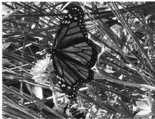
A monarch butterfly pictured here in our Maple Drive Street Parking Lot's Sanctuary.