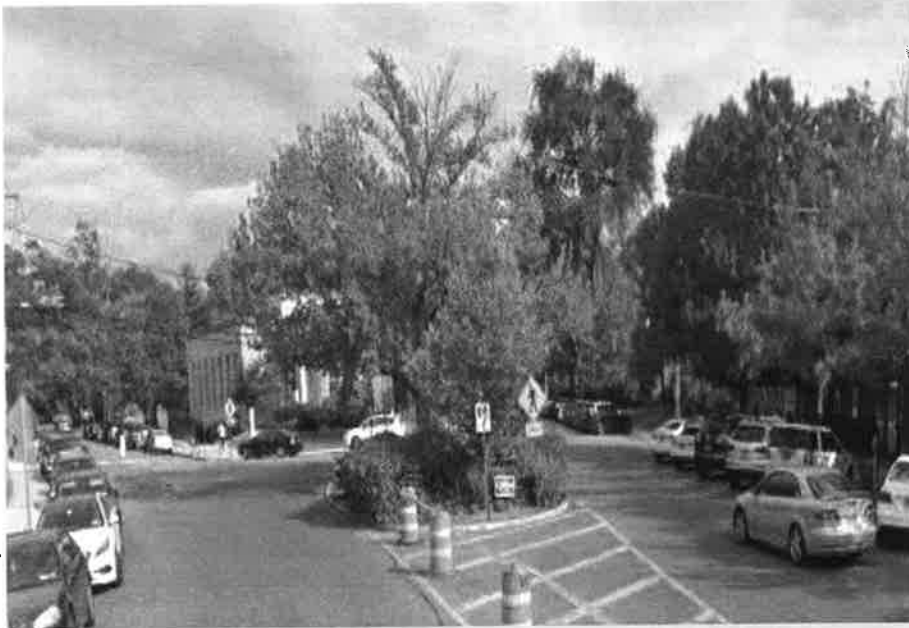
Pictured here is the intersection between Shoreward Drive and Welwyn Road, where construction will be taking place.

a raised median and shoulder area curb extensions, similar to other locations improved throughout the Village. It will also provide new brick walkways consistent with the Village's standard in the downtown commercial district. Using innovative design concepts, such as raised crosswalks and "sharrow" (shared lane markings), it will promote pedestrian and bicycle activity and improve safety. All of the proposed project improvements are in conformance with the Village of Great Neck Plaza's Complete Streets Policy Guide, which was adopted by the Board in 2012.